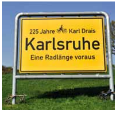
and member contribu- Fig. 5: Karlsruhe, home to the inventor tion from municipalities. of the bicycle

The Land BW also provides the network with financial support through: