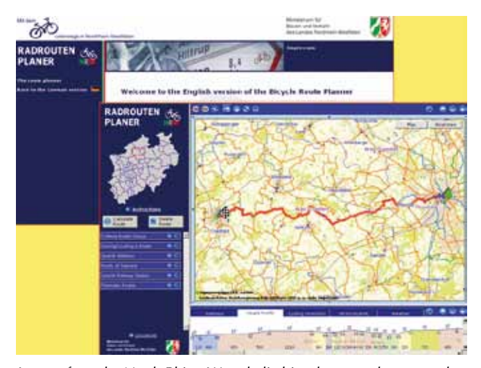
Images from the North Rhine-Westphalia bicycle route planner on the Internet at www.fahrradfreundlich.nrw.de

In addition to municipal cooperation on individual routes, the individual Länder have assumed an active role in creating a network of cycling paths within their territories. They establish a conceptual framework by publishing manuals on the necessary infrastructures for a cycling path network, writing newsletters for municipal players and, above all, providing state funding for infrastructure. Specialized planning offices work in a supporting function until a route is officially opened, usually as part of a cycling awareness day in the spring. In this way an integrated network has been successfully created in just a few years – despite the roads and paths being under different ownership, fundings coming from different sources, planning conflicts with road